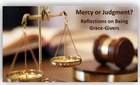
Wednesdays, 6:30pm in the Worship Center

Remember to set your clocks ahead one hour next Sunday, March 11